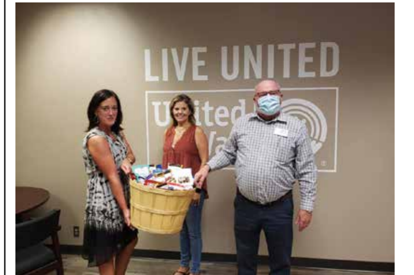
A donation of goodies to frontline workers at UWBC was presented from the Alvin Sunrise Rotary Club. Thank you for recognizing our case managers on the frontlines who are helping those affected by Covid-19.